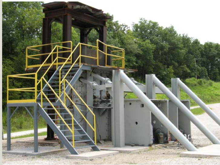
Vertical Test Fire Stand