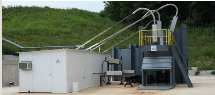
Horizontal Test Fire Range